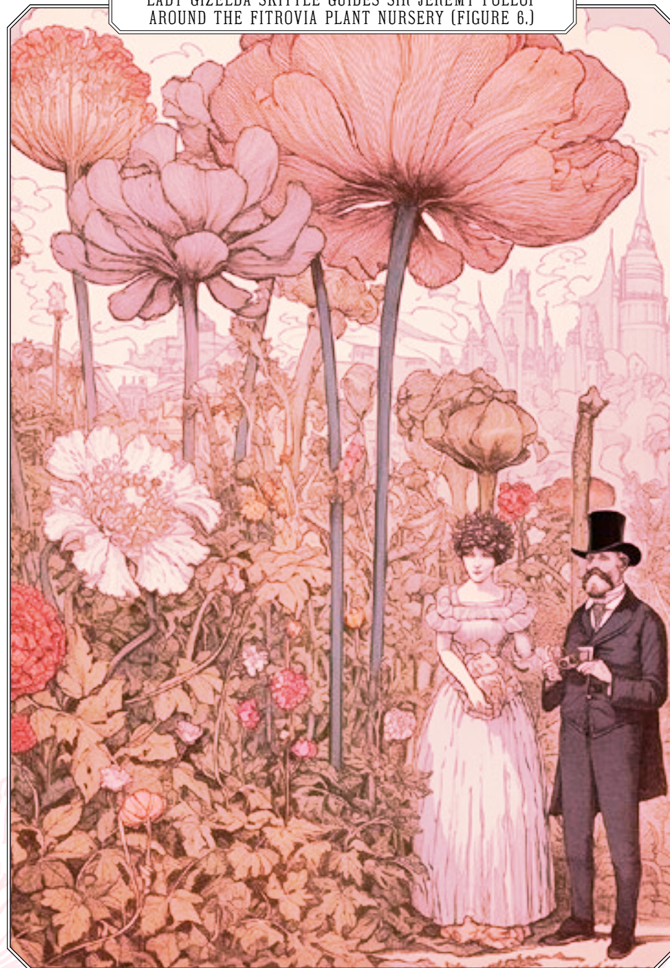
LADY GIZELDA SKITTLE GUIDES SIR JEREMY POLLOP AROUND THE FITROVIA PLANT NURSERY (FIGURE 6.)

Please make staff aware of any allergies and intolerances you might have. A full list of all allergens contained in each cocktail is available upon request. All items include VAT. All items are subject to availability. A discretionary 12.5% service charge will be added to your bill.