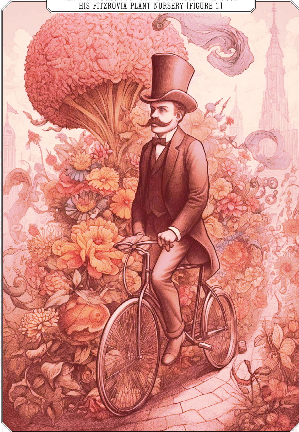
PHILEAS J. FOGG ESQ. RIDING HIS BICYCLE THROUGH HIS FITZROVIA PLANT NURSERY (FIGURE 1.)