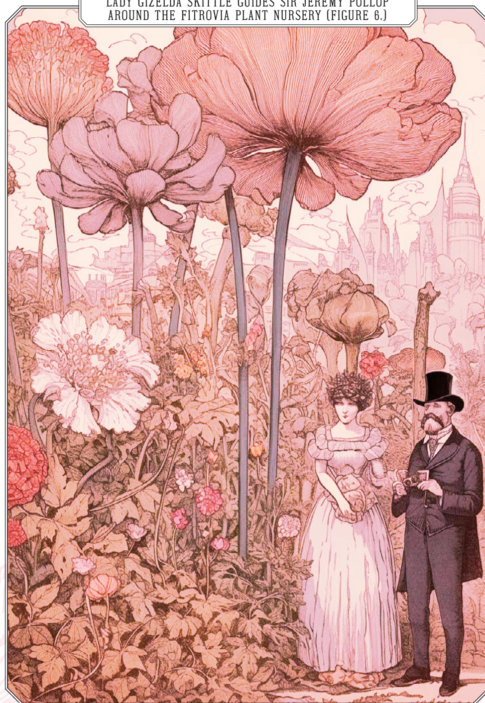
LADY GIZELDA SKITTLE GUIDES SIR JEREMY POLLOP AROUND THE FITROVIA PLANT NURSERY (FIGURE 6.)

Please make staff aware of any allergies and intolerances you might have. A full list of all allergens contained in each cocktail is available upon request. All items include VAT. All items are subject to availability. A discretionary 12.5% service charge will be added to your bill.