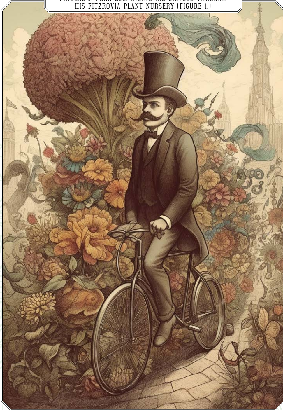
PHILEAS J. FOGG ESQ. RIDING HIS BICYCLE THROUGH HIS FITZROVIA PLANT NURSERY (FIGURE 1.)