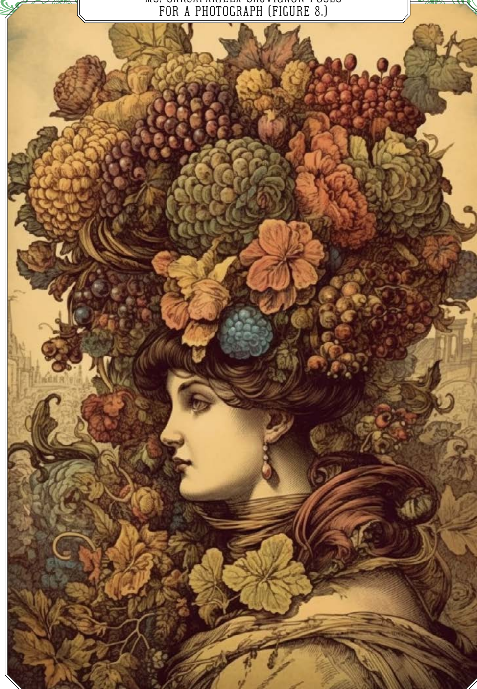
MS. SARSAPARILLA SAUVIGNON POSES FOR A PHOTOGRAPH (FIGURE 8.)