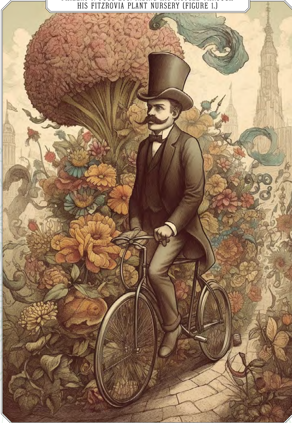
PHILEAS J. FOGG ESQ. RIDING HIS BICYCLE THROUGH HIS FITZROVIA PLANT NURSERY (FIGURE 1.)