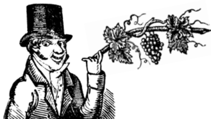
MS. SARSAPARILLA SAUVIGNON POSES FOR A PHOTOGRAPH (FIGURE 9.)