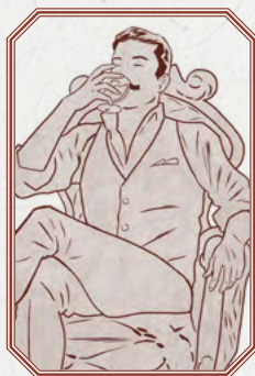
PHILEAS FOGG The finest explorer the World has ever seen

FOGG'S FAVOURITES, WINE, CHAMPAGNE & MORE... 16-21