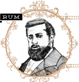
ANTONI GAUDÍ i CORNET

SAGRADA UNFAMILIAR £15 CREAMY / SWEET / TROPICAL Santa Teresa 1796 rum, Figaro fig liqueur, zabaione, blended banana & coffee almond milk and salted cinnamon syrup