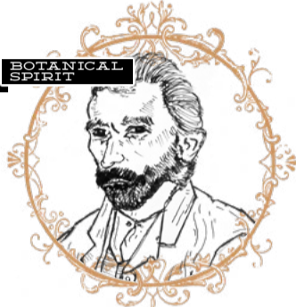
VINCENT WILLEM van GOGH

CRAZY IN LOVE £15 SWEET / FRUITY / TROPICAL Ketel One Botanical Grapefruit & Rose spirit, Muyu Jasmine Verte liqueur, passion fruit juice, yoghurt powder and Moët & Chandon Impérial Blanc N.V. Champagne cordial