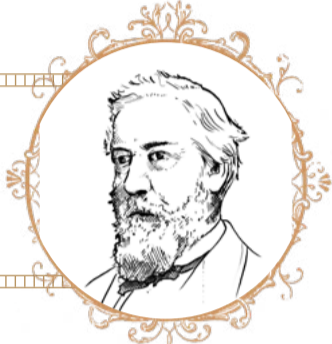
JAMES GILLESPIE BLAINE

THE APACHE RENEGADE £16 FRESH / LIGHT / DELICATE Patrón Silver tequila, Laphroaig 10yr Scotch whisky, prune eau de vie, verjus and epazote-infused agave syrup