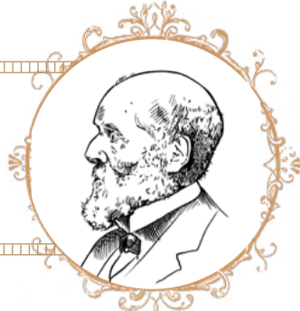
SIR JOHN GAY NEWTON ALLEYNE, 3rd BARONET

LIGHTBULB MOMENT £15 ORIENTAL / TROPICAL / SOUR Bacardi Carta Blanca rum, Wray & Nephew White Overproof rum, Chambord black raspberry liqueur, lychee & jackfruit purée, pink grapefruit juice and vanilla syrup