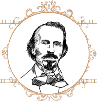
CARLOS MANUEL de CÉSPEDES del CASTILLO

SAGRADA UNFAMILIAR £15 CREAMY / SWEET / TROPICAL Santa Teresa 1796 rum, Figaro fig liqueur, zabaione, blended banana & coffee almond milk and salted cinnamon syrup