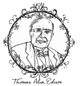
Lightbulb Moment £15 ORIENTAL / TROPICAL / SHARP Wray & Nephew White Overproof rum, Chambord black raspberry liqueur, lychee & jackfruit purée, pink grapefruit juice and vanilla syrup

Vincent Van Jogh Crazy in Love £16 SWEET / FRUITY / TROPICAL Ketel One Botanical Grapefruit & Rose spirit, Muyu Jasmine Verte liqueur, passion fruit juice, voghurt powder and Moët & Chandon Brut Impérial Blanc N.V. Champagne cordial