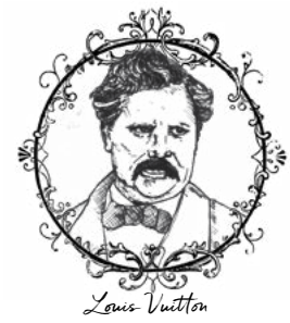
A Chequered History £28 WOODY / RICH / INTENSE Hennessy X.O. cognac, Discarded cascara vermouth, Grand Brulot coffee liqueur, coffee glaze and Angostura Orange bitters

Bohemian's Rhapsody £16 HERBAL / SPICY / GINGERY Dewar's 12yr Scotch whisky, Asahara Shuzo nigori umeshu, Suze gentian liqueur, Peychaud's Spicy Bitters and Fentimans ginger ale