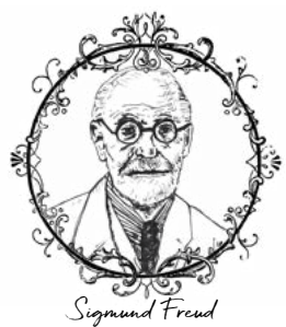
Freudian Sip £14 SWEET / WOODY / BITTER Aperol aperitif, Woodford Reserve Bourbon whiskey, Montenegro amaro and calamansi purée Turn over for more marvellous tipples..

ALL OF OUR SINGLE-SERVE STRAWS ARE FULLY BIODEGRADABLE. A DISCRETIONARY 15% SERVICE CHARGE WILL BE ADDED TO ALL TRANSACTIONS.