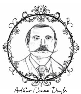
My Deer Stalker. My Dear Watson £16 RICH / WOODY / BITTER Johnnie Walker Gold Label Reserve Scotch whisky, Martini Riserva Speciale Rubino vermouth, Martini Riserva Speciale Bitter aperitif, Cynar artichoke liqueur and artichoke oil